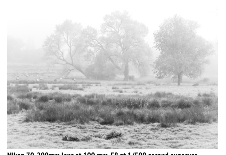
Nikon 70-200mm lens at 100 mm, F8 at 1/500 second exposure, ISO 800 handheld