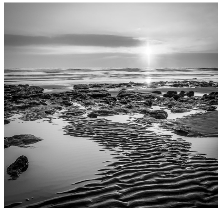
Bawdsey Beach Nikon 24-70mm lens at 24mm. F16 at 2 second exposure, ISO 100, 0.6ND grad filter.

Patterns and textures are fantastic for adding interest in black and white photography and work really well in the foreground of a shot. They add tonal contrast and detail to specific areas of the frame and can be used as compositional elements in their own right. In this image below the patterns in the sand are accentuated by their shadows and form a curved line into the image.