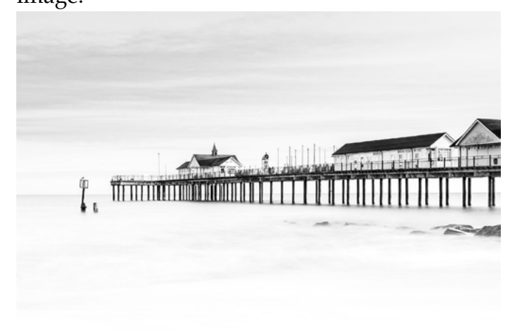
Southwold Pier Nikon 24-70mm lens at 30mm, F14 at 7 second exposure, ISO 100, aperture priority, 0.6ND grad filter.

High key images are ones that consist of mostly black and white with very few mid tones. The background should be bright and the idea is to focus the viewers attention to the subject. The image below shows Southwold Pier on a bright day with only fine wispy clouds in the sky. I used a slow shutter speed to blur the water and slightly over exposed the image to create a very milky effect in the sea. I then used post processing to reduce the tones in the sky and make the pier really stand out from its background. Narrow apertures of F14 to F16 work well as they reduce the transition between whites and blacks making a high contrast image.