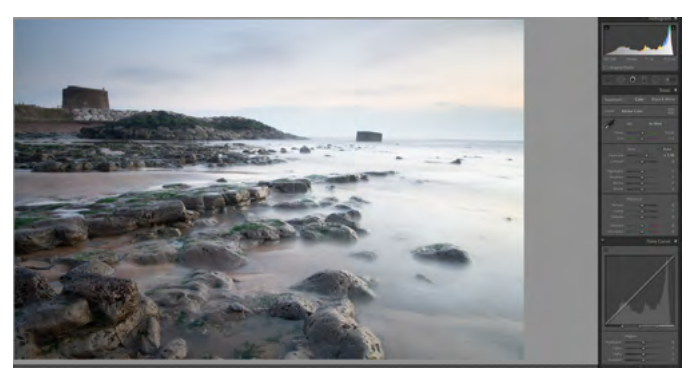
Colour image above and treatment panel below which will give a very crude conversion to black and white.

There are a couple of ways of converting your images into black and white in post production. I will talk about Lightroom here as that is what I use but Photoshop is a good alternative. There are also other specialist conversion programmes such as Silver Efex Pro which are worth looking into if you want to do a lot of black and white photography. In Lightroom just under the histogram on the right hand side is a treatment panel showing colour or black and white. Clicking this will take your photo from colour to black and white. However it will not be a very impressive conversion and will probably look very flat.