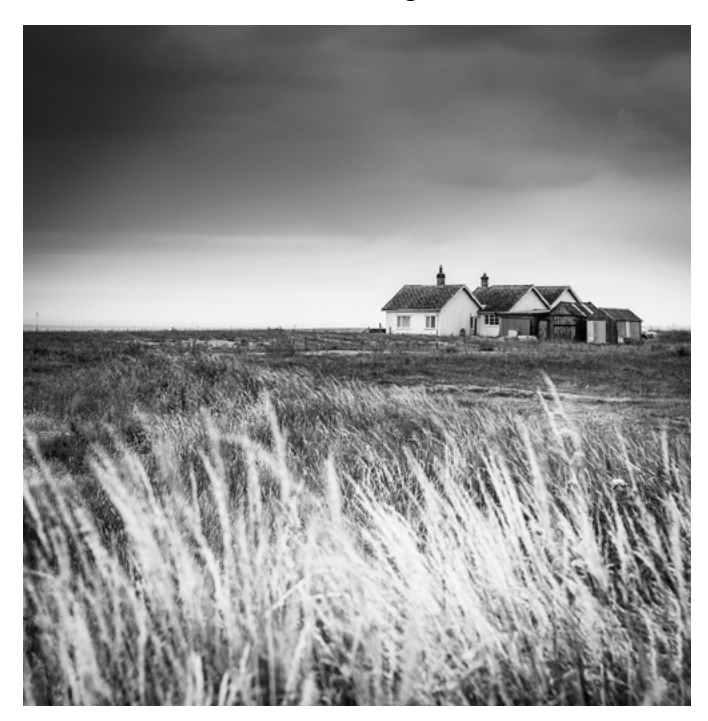
Shingle Street Nikon 24-70mm lens at 52mm. F5.6 at 1/6 second exposure, ISO 100, 0.6ND grad filter.

Textures are everywhere in the landscape, you just need to look for them. They often involve some kind of repeating pattern and can be found in rocks, sand, grasses, tree bark, timber, leaves or building materials. The grasses in the image below form an interesting texture and pattern in the foreground of the shot. They work well because they contrast nicely with the darker tones in the image.