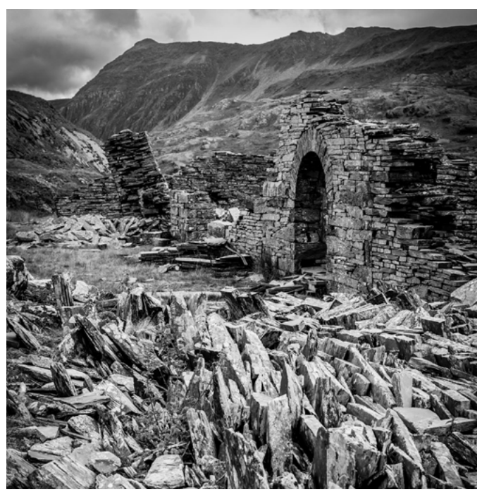
Welsh slate quary Nikon 24-70mm lens at 55mm, F11 at 1/125 second exposure, ISO 400, aperture priority

The piles of slate in this next image create a foreground that is full of interest and the slate wall and arch lead the eye towards the distant hills which have a much smoother texture.