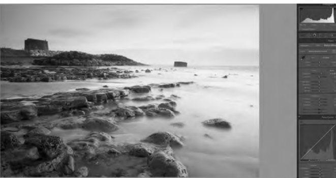
The image above shows the result of applying the black and white conversion in the treatment panel. Once you have done this

open the HSL / Colour / B & W panel and click the B&W tab. This opens a set of sliders which control how bright the conversion renders each underlying colour.