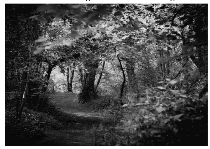
Path through the gorge Nikon 24-70mm lens at 70mm, F4 at 1/80 second exposure, ISO 800, aperture priority, handheld.

make the transition from highlights to shadows less defined creating a low contrast image.