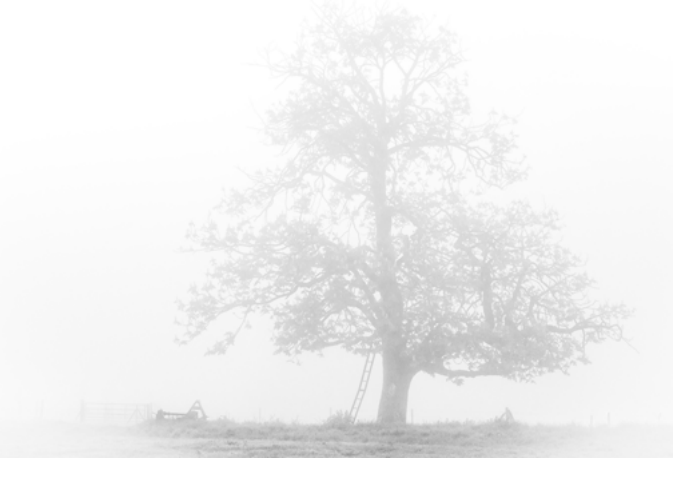
The Witness Tree Nikon 70-200mm lens at 70mm, F7.1 at 1/400 second exposure, ISO 800, aperture priority, handheld.

The image below is another from my Hollesley Marshes project and was taken on a really misty morning. It has a very subtle feel to it, has no black elements but I still think it captures the mood of that particular morning.