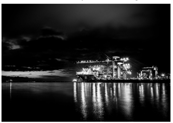
Felixstowe Docks Nikon 24-70mm lens at 24mm, F16 at 6 seconds exposure, ISO 400, aperture priority.

contrast - ie the dark and light areas. In the picture below of Felixstowe docks the bright white of the lights sit against the black of the night sky creating a striking visual contrast. It is this that draws the eye into the image.